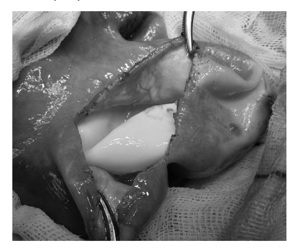
Fig. 2: Huge hydatid cyst was opened and the contents evacuated

The informed consent of the patients was taken to report this case report.