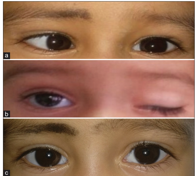
Figure 2: Botulinum toxin A injection alone (Control): (a) pre-injection deviation, (b) Severe ptosis 2 weeks post-botulinum toxin A injection, (c) Successful ocular alignment after 6 months

The occurrence of ptosis in our study was 12% ( n = 3 ) in SH group and 26.6% ( n = 8 ) in controls against 2.2% ( n = 1 )