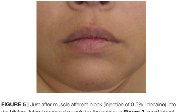
FIGURE 5 | Just after muscle afferent block (injection of 0.5% lidocaine) into the bilateral lateral pterygoid muscle for the patient in Figure 2 , rapid lateral jaw movements were completely suppressed (See also Video 5 ).

The author's department specializes in oral and maxillofacial surgery. Therefore, the author solely examined the patients who