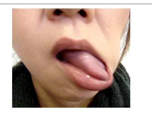
FIGURE 3 | Tongue movement accompanying mandibular movement is complex and bizarre. It does not fall into any of the known movement disorders (See also Video 3 ).

Some patients had a combination of organic and functional diseases. The clinical characteristic features of organic oromandibular dystonia are summarized in Table 2 .