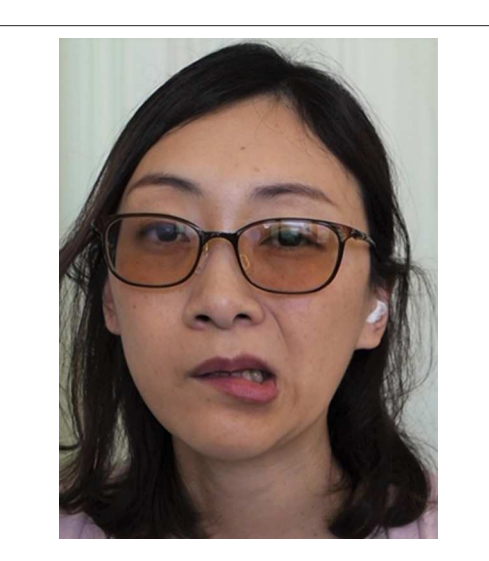
FIGURE 1 The clinical presentation of functional stomatognathic movement disorders. A case with the well-known "classic" phenotype of orofacial functional dystonia. The patient shows unilateral lower lip pulling, jaw deviation, and platysma contraction (See also Video 1 ).