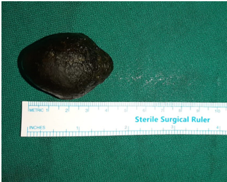
FIGURE 4: intraoperative image of calculus (4cmx2.5cm)