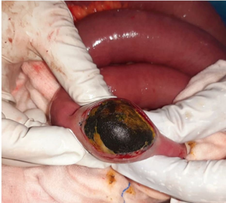
FIGURE 3: Intraoperative image of longitudinal enterotomy with the calculus