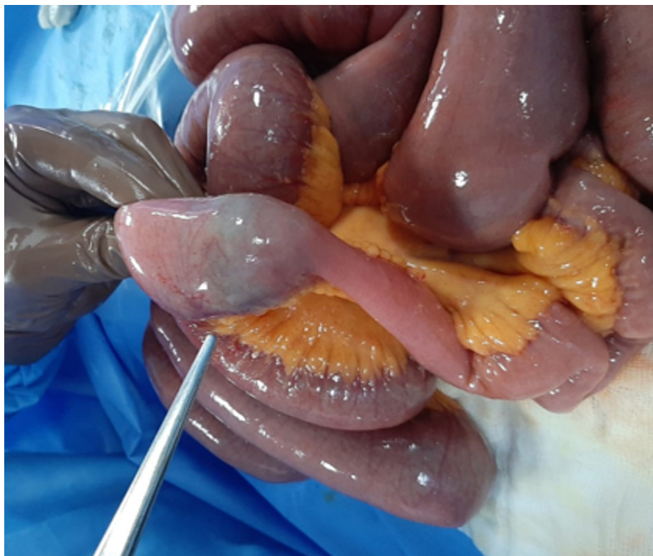
FIGURE 2: Intraoperative image showing the transition point between dilated proximal jejunum and distal collapsed bowel. The calculus can be seen through the wall of the bowel

A longitudinal enterotomy was made on the bowel over the calculus, and the stone was extracted out (Figure 3 and Figure 4).