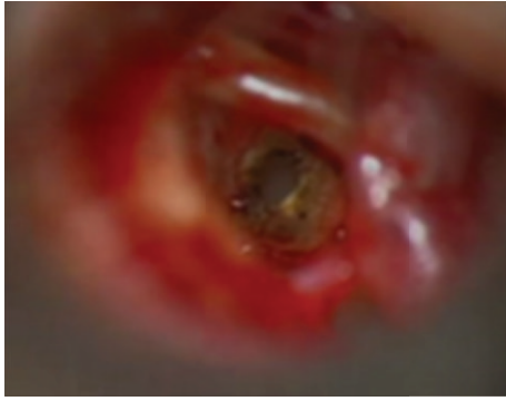
FIGURE 1: Laser shooting of the footplate.