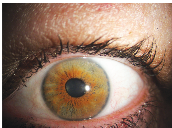
Fig. 3: Typical appearance of postiridoplasty scars