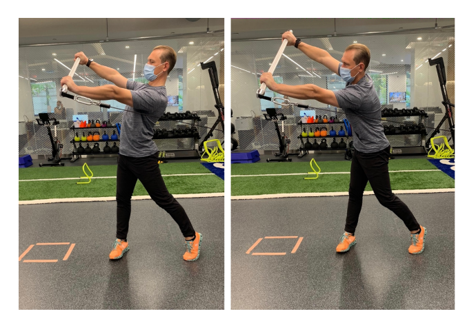
Figure 9: Kinetic change breakdown: (a) poor kinetic chain linking with an upward cable lift; notice the rib flare and increased low back lordosis, (b) proper kinetic linking with stable core to dissipate force throughout the kinetic chain

The main goals of this phase are to regain high levels of proprioception, neuromuscular control, strength, and fitness with the intent to return to previous levels of athletic activity.<sup>80</sup> The overall goal for any athlete is to not only to return to their sport, but to return to their sport at the highest level possible. As activity is increased during this phase to include progressive plyometric activity and agility training, caution should still be taken on potentially overloading of the patellofemoral joint with increased activity.<sup>82</sup> Athletes need to continue to be diligent with their lower extremity strength gains in this phase allowing for proper support of their knee joint with higher level activities. An advanced