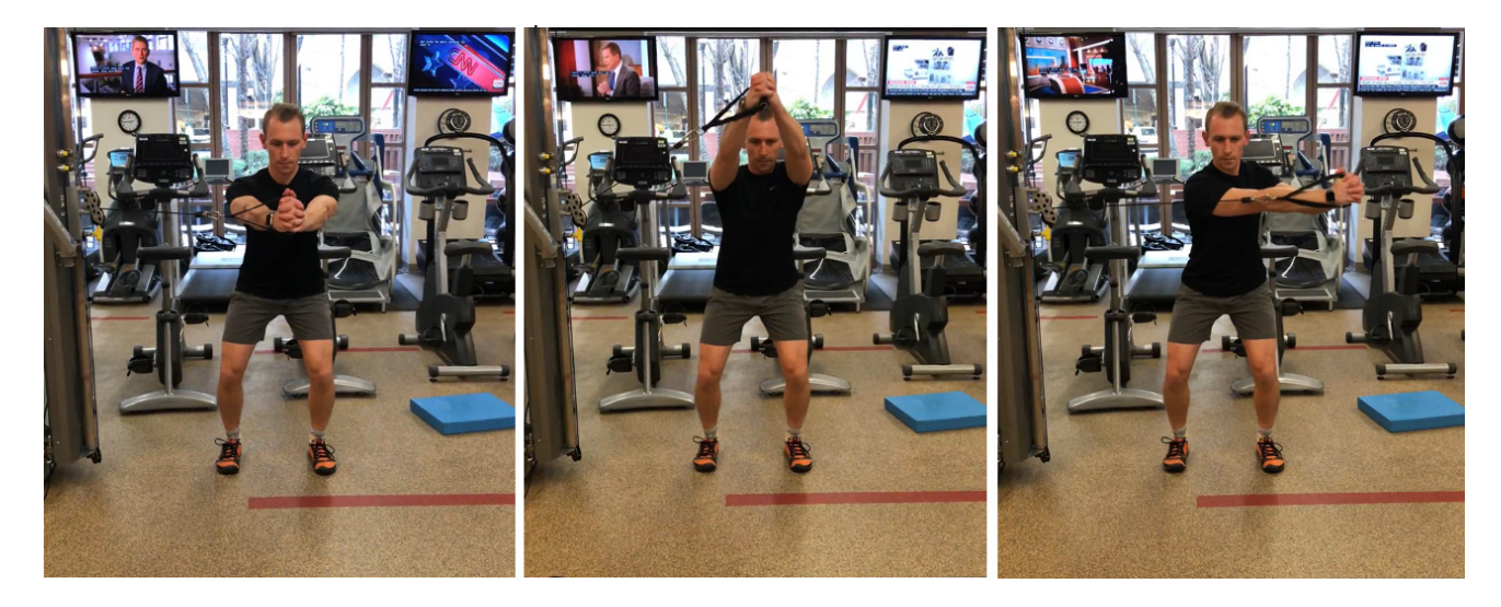
Figure 7: Pallof Press variation: (a) frontal plane (core activation), (b) sagittal plane (core strength), (c) transverse plane (rotational stability)

ple visual assessment of movement patterns to biomechanical analysis using a motion capture system. Although the joint is structurally repaired at this point and pain continues to improve, athletes may have developed altered movement patterns that became ingrained in their neuromuscular system. These discrepancies can continue to be present unless they are observed in a qualitative and quantitative manner and corrected previously during the rehabilitation process. A movement assessment for the athlete can help identify weaknesses in the kinetic chain, and aid in the development of a global plan to allow the athlete for a more efficient return to their sport.<sup>58</sup>