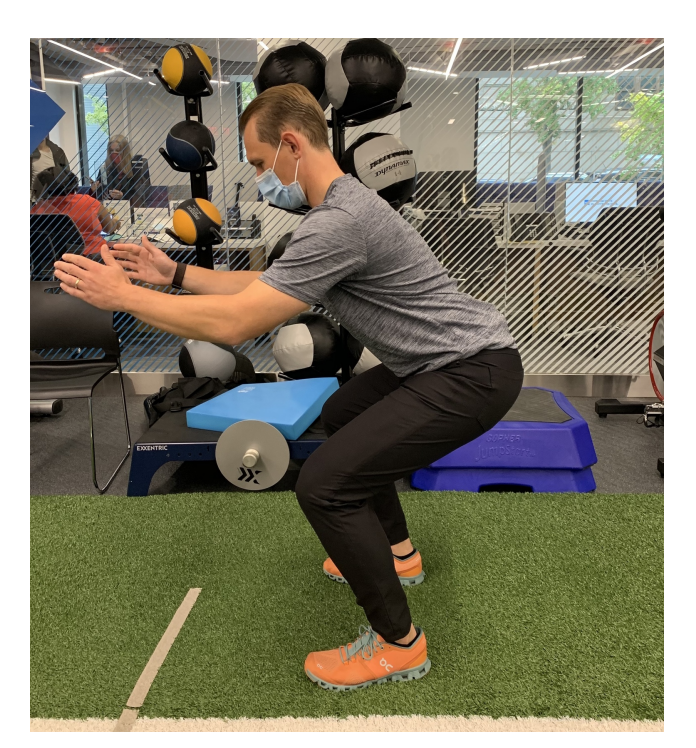
Figure 5: Proper hip hinge pattern for double leg squat

Full ROM should be attained in this phase through continued use of the stationary bike along with hip flexor and quadricep stretching. The athlete should be encouraged to stretch and mobilize often throughout the day to avoid forceful manipulation of the knee joint and subsequent