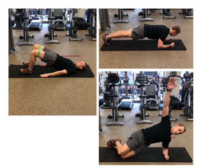
Figure 3: Preliminary Kinetic linking: (a) DL bridge with band abduction, (b) front plank, (c) modified side plank

This next transition phase of rehabilitation focuses on progressive strengthening, and typically lasts until 12 weeks post-operatively.<sup>54–57</sup> Strengthening in this phase should transition to exercises that progressively load the knee joint. Careful consideration must be taken in this phase of rehabilitation as the athlete resumes most activities of daily living. Most athletes with osteochondral defects have experienced chronic pain associated with their lesions, as it is a common occurrence for this patient population to delay receiving definitive treatment. Because of this, the aspect of pain had been prevalent in their everyday activities before, and thus the idea of "some pain is normal" continues to be in their mindset. In this phase of rehabilitation, the athletes' pain continues to dissipate, and they may want to return to their sport sooner than recommended. Proper education should be addressed with the athlete, placing an emphasis on the biologic healing required to take place in conjunction with progressive strengthening and conditioning necessary for a proper and safe progression. Multiplanar gluteus and hip strengthening should be introduced at this phase as weight bearing precautions and protocol allows. Examples of exercises emphasizing these muscles groups include standing hip clocks with band resistance, and lateral or monster walks. (Figure 4) Constant cues should be given to athletes regarding proper loading and proper joint