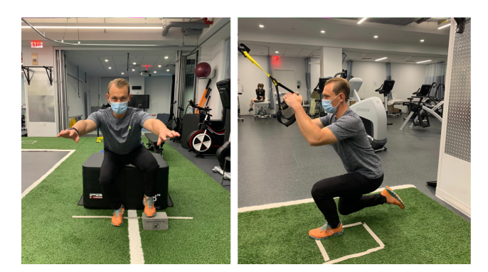
Figure 8: Single leg squat progressions (a) block underneath foot to decreased weight bearing on that side, (b) Suspension system assisted single leg squat

progressed well to this point, they should continue to monitor the overall load on their knee to prevent any persistent effusion or pain.