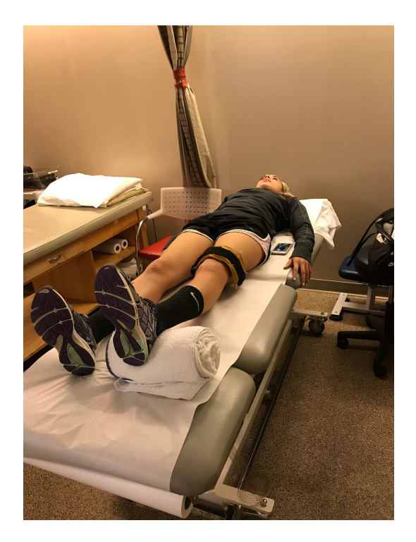
Figure 1: Passive knee extension on raised towel to promote immediate full knee extension

Along with activation of the quadriceps musculature, a preliminary development of core stabilization should be initiated during this phase. Athletic movement is dependent on the synergistic work of the entire kinetic chain, with the proximal musculature, including the hips and abdominal region, having a major role in linking the upper and lower kinetic chain.<sup>41,42</sup> At times, core activation and