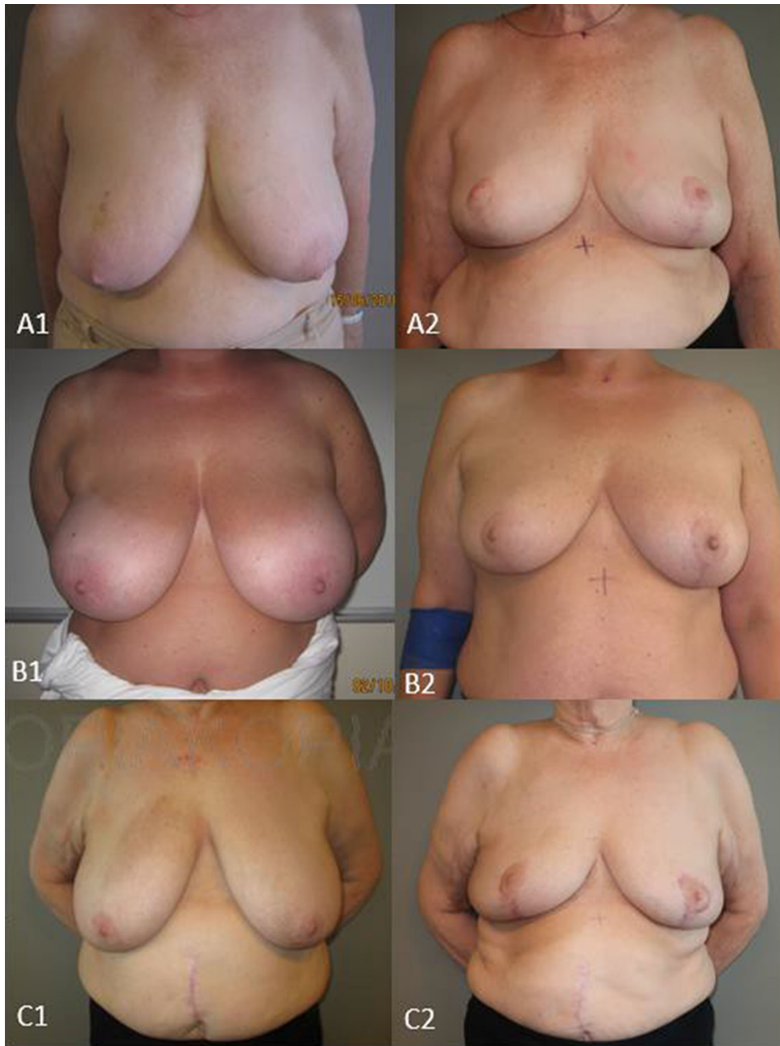
Fig. 2 Pre- and postoperative picture by different BCCT.core scores. A2: BCCT.core Excellent”,B2: “BCCT.core “Good” C2: BCCT.core “Fair”