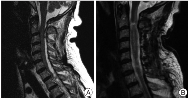
Fig. 1. A : A T2-weighted magnetic resonance imaging (MRI) shows an acute epidural hematoma compressing the cervical spinal cord and causing central apnea and quadriplegia and subsequent development of myelomalacia. B : An MRI taken at postoperative 3 months showing the focal high signal intensity at the C2 level, suggesting focal myelomalacia.

started. In the morning two days after anticoagulation, she felt heaviness in both legs and progressive paraparesis. A neurologist evaluated her and requested a lumbosacral magnetic resonance imaging (MRI) of the lumbar spine. While waiting for the MRI, her paraparesis progressively increased and ascended; eventually she became quadriplegic and respiratory distress developed. After checking whole spine MRI, an emergent endotracheal intubation was performed and neurosurgical consultation was taken. On examination, she was alert and no focal