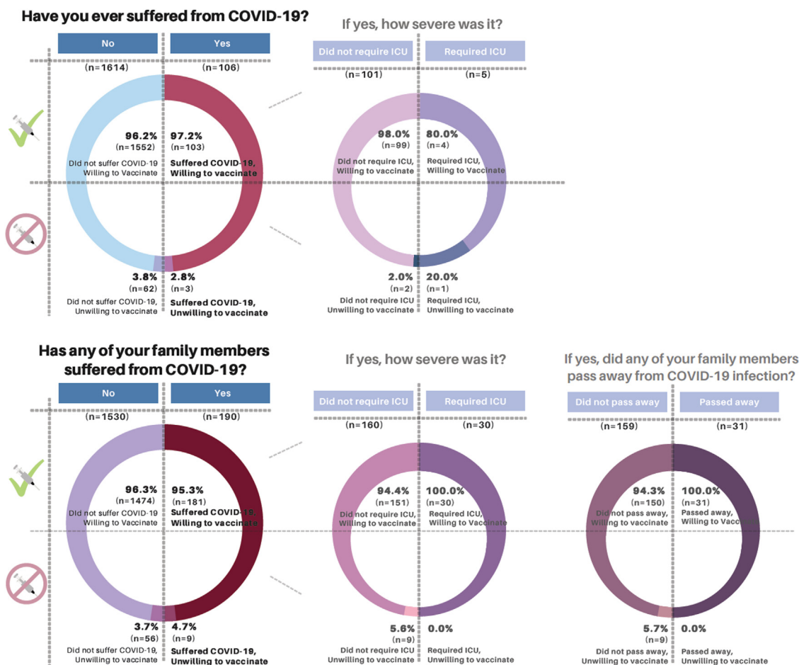
Figure 3. The COVID-19 risk profile of participants and family members and willingness to receive the COVID-19 vaccination.

Multivariate analysis of healthcare workers was performed to assess independent predictors of willingness to vaccinate. After