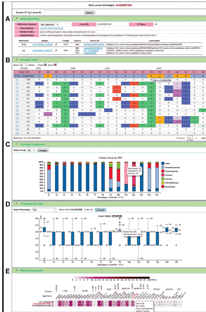
Figure 2. An example of a locus page showing multiple types of information associated with the locus. Rice gene GS5 controlling grain size is on locus OsG00067204. (A) Two reference genomes contain different alleles at the locus. (B) Genotype table showing all genotypes in the rice population, with reference genome positions in the first row of the table and reference bases in the second row. Genotype IDs are enumerated from T1 as the most frequent genotype (allele or haplotype for homozygous genome). '0' indicates that the genotype at this position is the same as in the reference genome. Capitalized bases indicate homozygous variants, lowercase bases indicate heterozygous variants and '-' indicates missing information. In the REF row, the letter 'N' represents a short insertion in the reference genome compared with some other samples. In the GT row, the 'N' represents insertion of bases in the samples compared with the reference genome. (C) Distribution of each genotype (allele) in a rice population. For example, the majority of genotype (allele) T1 is found in temperate japonica lines (1251 out of 1769). (D) Boxplot showing the relationship between genotypes and phenotypes. The phenotype can be selected by users from all collected traits in the database. In this case, the locus OsG0067204 is known to be associated with grain width (GW) traits. (E) Expression profile at the locus in different reference genomes in different tissues.

group of SNPs and short indels, which are either adjacent or non-adjacent on a chromosome. A genotype is equivalent to a haplotype when the identified SNP and indel are homozygous in a genome. We define four types of genotypes: (i) positional genotype at a single SNP or indel position, (ii) locus genotype at a gene locus (i.e. an allele in a homozygous genome) (Figure 2), (iii) customized genotype for a group