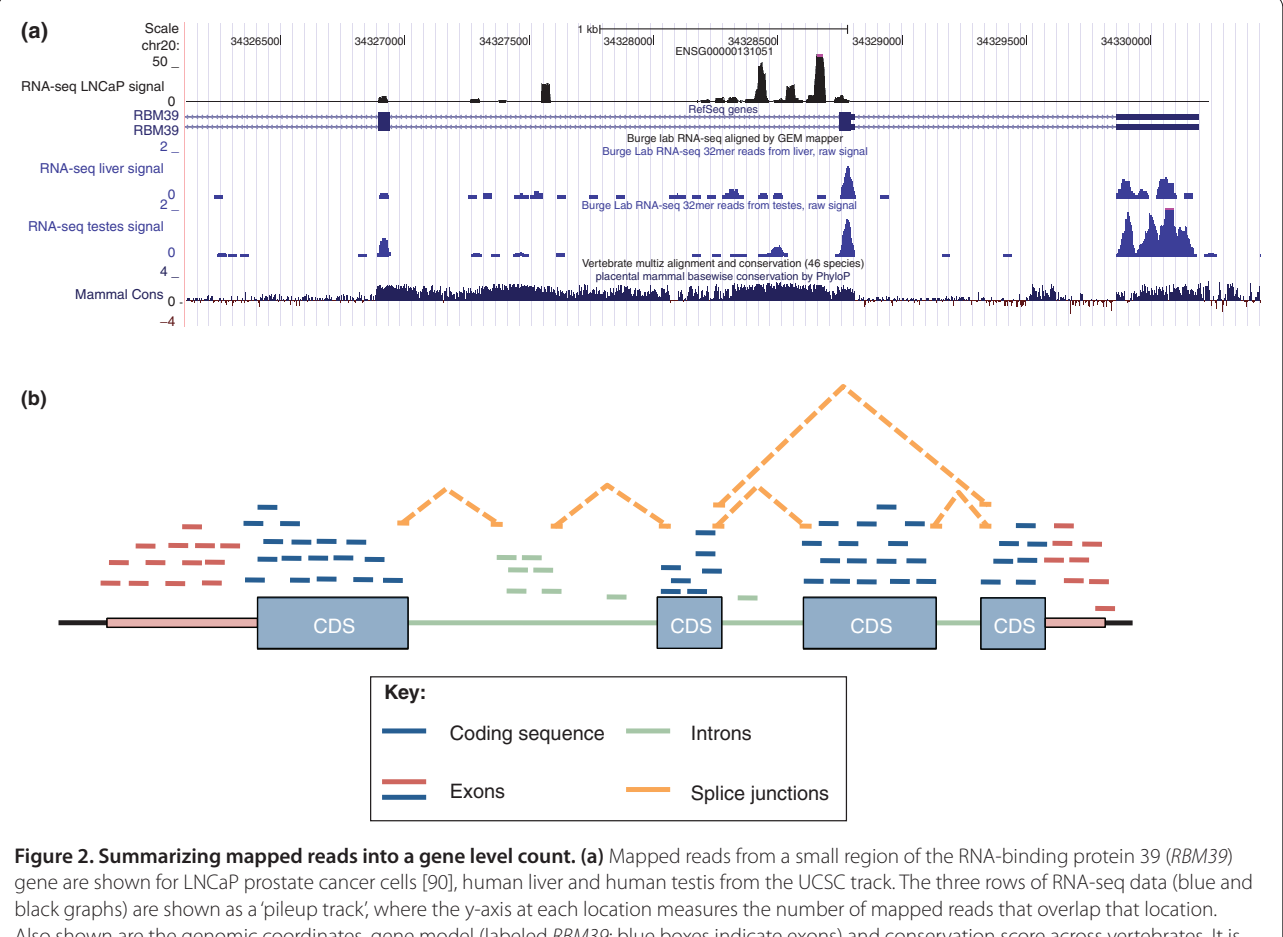
Also shown are the genomic coordinates, gene model (labeled RBM39 ; blue boxes indicate exons) and conservation score across vertebrates. It is clear that many reads originate from regions with no known exons. (b) A schematic of a genomic region and reads that might arise from it. Reads are color-coded by the genomic feature from which they originate. Different summarization strategies will result in the inclusion or exclusion of different sets of reads in the table of counts. For example, including only reads coming from known exons will exclude the intronic reads (green) from contributing to the results. Splice junctions are listed as a separate class to emphasize both the potential ambiguity in their assignment (such as which exon should a junction read be assigned to) and the possibility that many of these reads may not be mapped because they are harder to map than continuous reads. CDS, coding sequence.

relative to each other. The simplest and most commonly used normalization adjusts by the total number of reads in the library [34,51], accounting for the fact that more reads will be assigned to each gene if a sample is sequenced to a greater depth. However, it has been shown that more sophisticated normalization is required to account for composition effects [48], or for the fact that a small number of highly expressed genes can consume a significant amount of the total sequence [45]. To account for these features, scaling factors can be estimated from the data and used within the statistical models that test for DE [45,46,48]. Scaling factors have the advantage that the raw count data are preserved for subsequent analysis. Alternatively, quantile normalization and a method using matching power law distributions [52,53] have also been proposed for between-sample normalization of RNA-seq. The non-linearity of both of