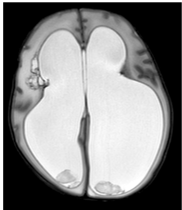
Fig. 1 Axial T2-weighted MRI demonstrating hydrocephalus secondary to Papile Grade IV intraventricular and intraparenchymal haemorrhage

Cranial ultrasound scan demonstrated hydrocephalus secondary to Papile Grade IV intraventricular and intraparenchymal haemorrhage and this was confirmed on subsequent MRI (Fig. 1). An anterior fontanelle tap was performed as