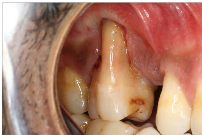
Figure 1: Preoperative photograph showing recession in relation to maxillary right 1 st molar