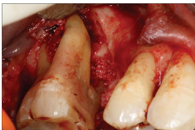
Figure 3: Bio-oss® bone graft material placed