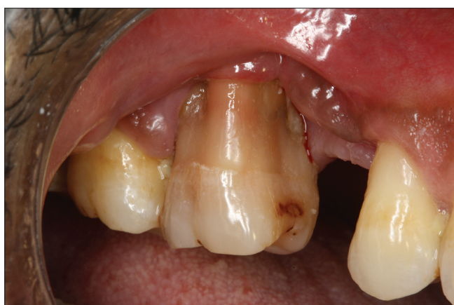
Figure 5: Postoperative photograph showing partial coverage of the gingival recession

A 2-cm horizontal incision was made at the base of the buccal flap that extended backward from above the upper second molar tooth and access to the PBFP was allowed. Blunt dissection was made through the buccinator and loose surrounding fascia which allowed the PBFP to be exposed into the mouth. The buccal extension and the body of the