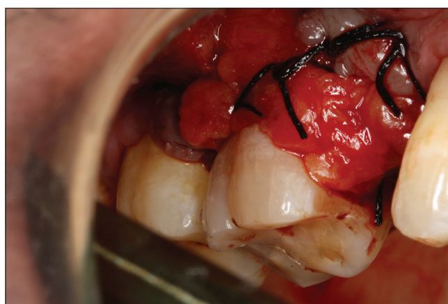
Figure 4: Buccal fat pad flap sutured in place