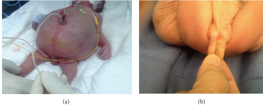
FIGURE 1: The abdomen was severely distended with signs of ascites (a). Also noted was ambiguous genitalia with a phallus like structure (b).