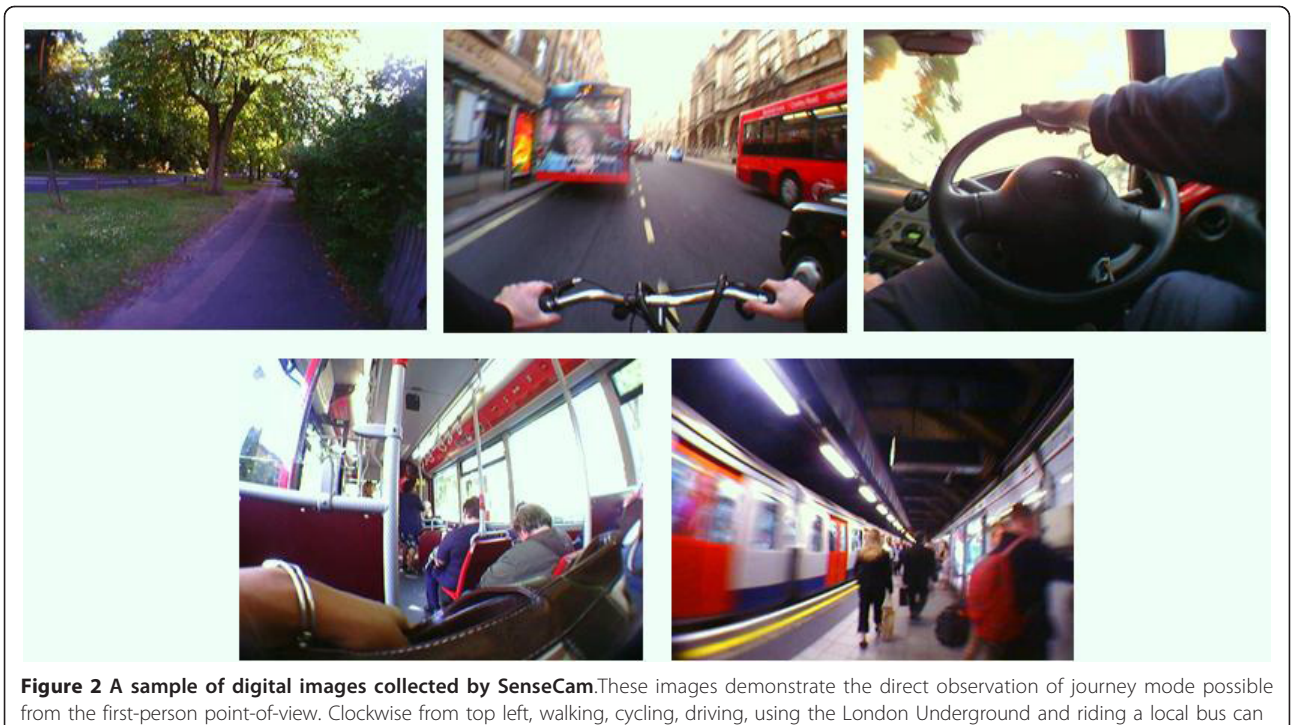
be clearly seen and distinguished from each other.