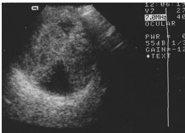
Figure 1 Dense echogenic shadow due to suprachoroidal haemorrhage on ultrasonography of the right eye (B scan, 10 Hz).

The needling was carried out in theatre. A subtenon anaesthesia of 2% lignocaine, which was uncomplicated, was used. Under aseptic technique Healon GV was injected with a 32-gauge needle into the conjunctiva adjacent to the bleb to form a diffuse bleb; this enables the adhesions in the conjunctiva to be broken down and allows the 5-fluorouracil to remain peripheral to the bleb where it is required to prevent conjunctival scarring and adhesions. Three subconjunctival injections of 2.5 mg 5-fluorouracil were then injected around the bleb. This technique has been previously described [4]. Postoperatively the anterior chamber was formed with an IOP of 6 mmHg and the patient was discharged. Two days later the patient represented with pain and right visual acuity reduced to hand movements. Clinically the patient had a formed anterior chamber and two large choroidal detachments. The IOP was 5 mmHg. The following day, the choroidal detachments had progressed to suprachoroidal haemorrhages. B-scan ultrasonography confirmed a dense non-mobile echogenic shadow consist with a suprachoroidal haemorrhage (Figure 1). Ultrasound also showed an attached posterior pole with no significant submacular haemorrhage. Five days after the initial needling the patient had complex surgery to reverse the hypotony, deepen the shallow anterior chamber and manage the suprachoroidal