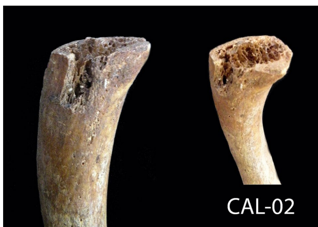
Fig. 5 A straight, precise, vertical cut, very like those made with medical instruments in autopsies, noted on the right clavicle

violence and can only be explained by autopsy. Saw marks can be seen on the frontal bone, while the rest of the cut marks are not visible due to the fragmented condition of the temporal bones (Fig. 7). However, the saw marks do not occur on the posterior part of the skull, suggesting that the skull was only partially open, without removing the brain. The surgical cuts on the right clavicle, which are too vertical and well defined to be a consequence of interpersonal violence, could be attributed to an autopsy.