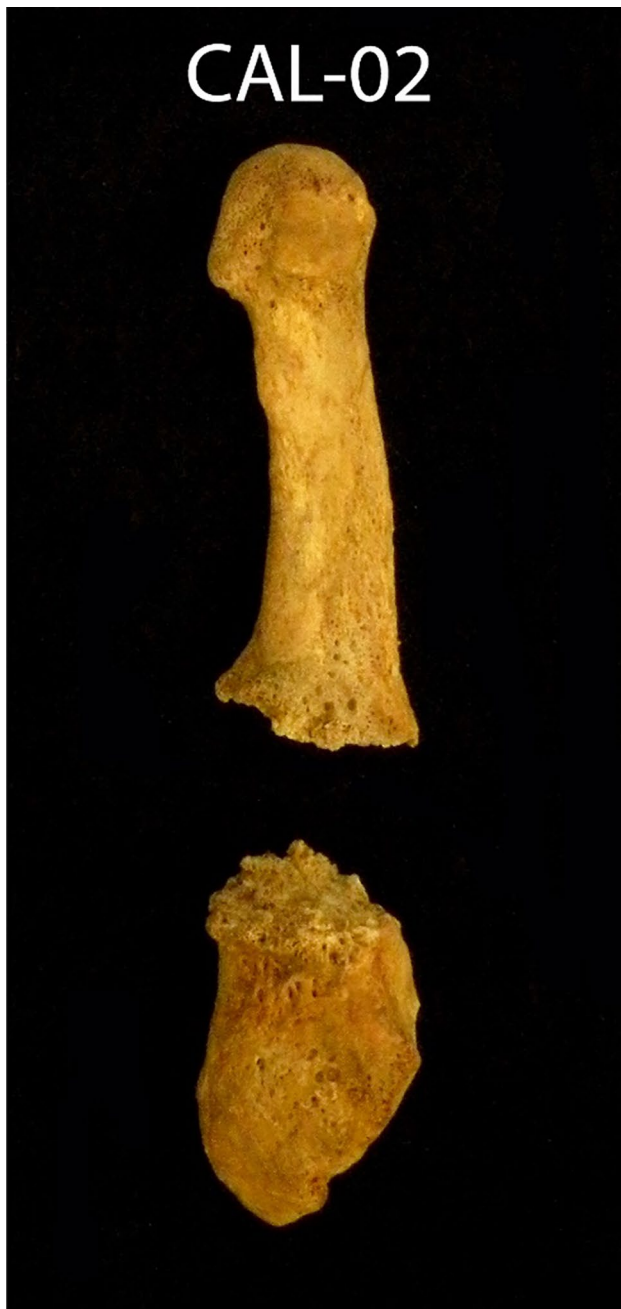
Fig. 2 A transverse fracture perimortem on the fifth metatarsal of the left foot

individual's death since there had been no fusion or callus formation.