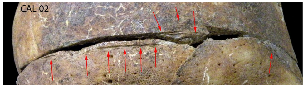
Fig. 7 Linear cuts, made by a saw, were found on the frontal bone, proving that a brain autopsy was performed (red arrows)

estimated murder victims have been identified through DNA in the last 20 years [22].