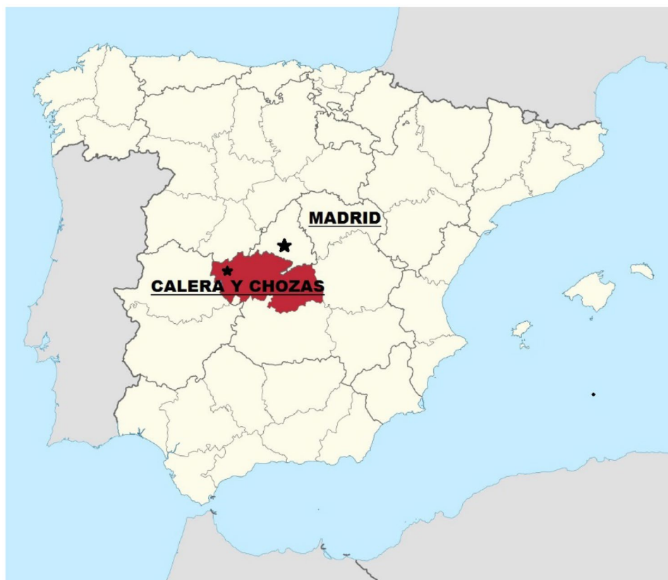
Fig. 1 Map of Spain with the location of the village Calera y Chozas

information, the group “Memoria Histórica de Calera y Chozas” began prospecting for mass graves that might contain the remains of missing relatives, killed between 1936 and September 1939.