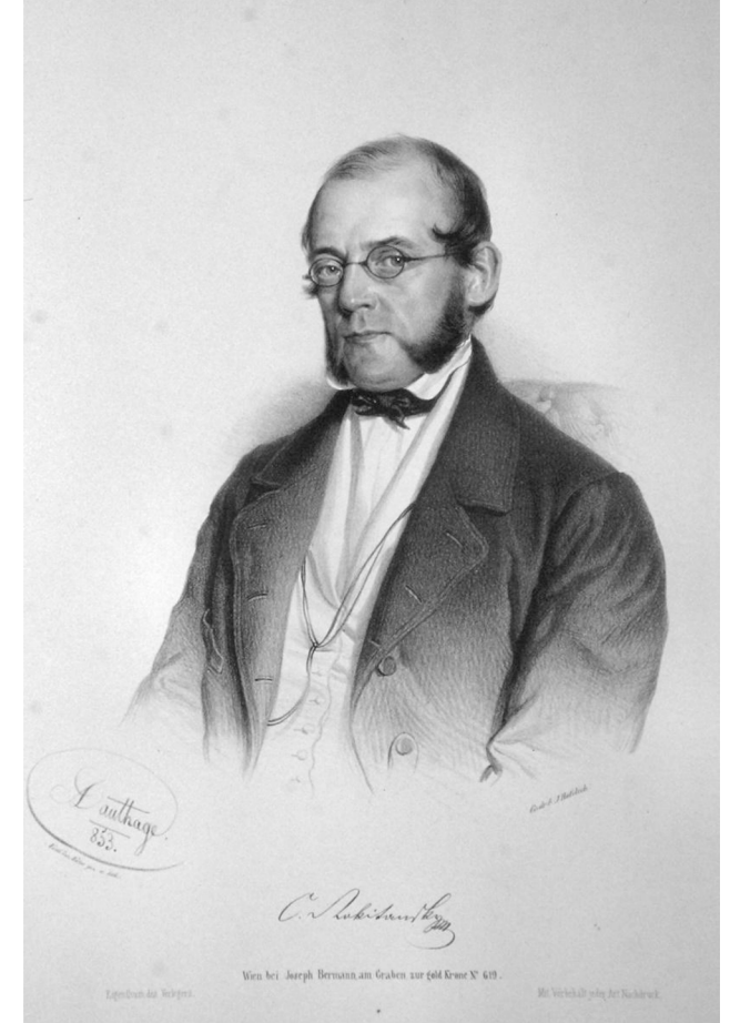
Figure I Rudolf Virchow (1821–1902).<sup>105</sup>

proof, that in the course of inflammatory processes, which it is impossible we should ever regard as simply passive processes, such transformations must take place.<sup>26</sup>