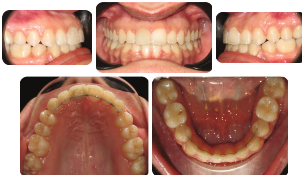
FIGURE 6: Posttreatment intraoral photographs.