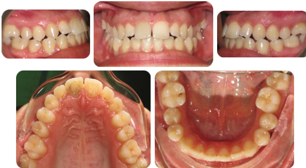
FIGURE 2: Pretreatment intraoral photographs.

factors, such as the severity of the mandibular anterior crowding, the Bolton discrepancy, and negative overjet and overbite intensity [15].