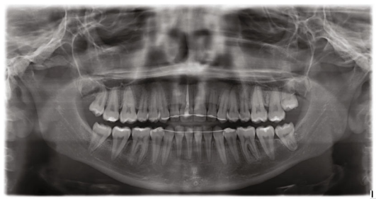
FIGURE 7: Posttreatment orthopantomogram.

cephalogram, the orthodontic camouflage improved the dental relationship with a normalization of upper incisor inclination without a relevant lingualization of lower incisors; the skeletal facial pattern of the patient experienced a slight improvement.