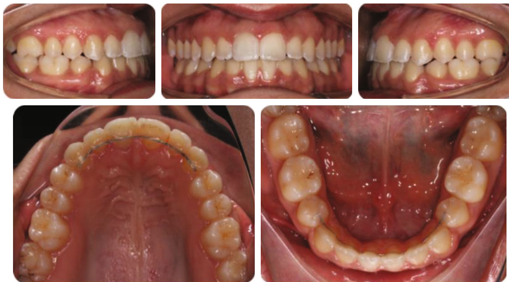
FIGURE 11: 12-month follow-up, intraoral photographs.

increased overjet are accompanied by the need not to worsen the position of the lower teeth, as it could instead happen using class II mechanics; long-term evaluation of patients treated with orthodontic class II camouflage did not highlight any functional damage [21, 22]. Similarly, for class III orthodontic camouflage, there is no evidence that single arch extraction could lead to functional damage, not even with molar class III relationship if canine class I relationship is achieved.