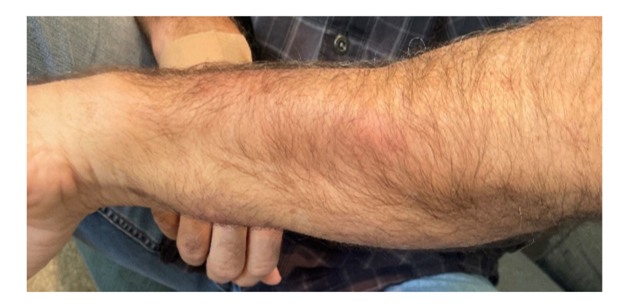
Figure 3. Lymphocutaneous spread manifested as painful, red, and swollen nodular lesion.