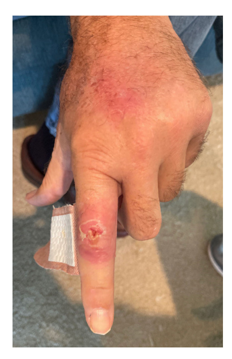
Figure 1. Redness and the swelling of the digit with infection spreading to the dorsum of the hand.

One week prior to ED presentation, the patient accidentally cut his left index finger with a kitchen knife while working on a pot with garden soil residue. Initially, he was evaluated by his primary care provider and was prescribed trimethoprim-sulfamethoxazole (Bactrim) 1 tablet 160/800 mg twice daily by mouth. Patient took the medication as prescribed for 2 days; however, the swelling and erythema began to spread up the dorsal aspect of the hand and he began noticing swollen lymph nodes in the forearm, elbow, and axilla (Figures 1–4). The patient did not have any fevers, chills, or any constitutional symptoms. Because of this clinical progression, he was re-evaluated by his primary care physician and treated with an intramuscular injection of 2 grams of ceftriaxone. He was instructed to stop Bactrim and to start doxycycline 100 mg by mouth two times a day. He took this regimen for 48 h, but due to worsening of the pain and swelling, presented to the ED for further evaluation.