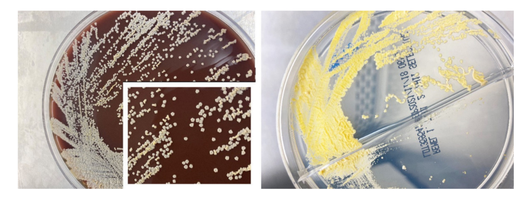
Figure 5. Nocardia brasiliensis growing after 5 days of incubation at 35 °C on Chocolate agar. Note the characteristic dry yellow/orange/white colony morphology. Note characteristic dry colonies resembling "molar teeth" (see inset). Nocardia brasiliensis growing after 5 days of incubation at 35 °C on Middlebrook 7H11//7H11 Selective Agar. Note the characteristic dry yellow/orange/white colony morphology.