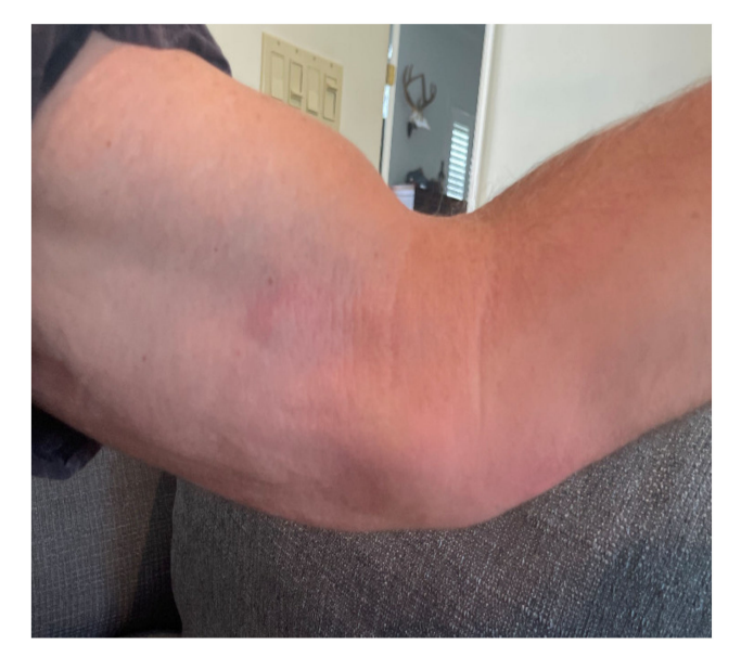
Figure 4. Further spread of infection involving cubital fossa and surrounding lymph nodes.