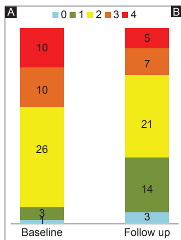
Figure 2 (A,B) Distribution of METAVIR fibrosis score at baseline and at the time of long-term biopsy (mean time interval: 72.6 months)

METAVIR fibrosis scores between baseline and follow-up biopsies is shown in Fig. 2.