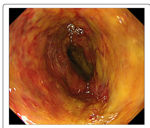
Fig. 3 Intraoperative endoscopy view during re-exploration. Intraoperative endoscopic findings revealed only partial ischemic injury to the mucosa only

procedure in emergent settings. The postoperative course was uneventful and the patient was discharged from hospital on postoperative day 43. Unfortunately, CT imaging at 1 month after discharge showed dilatation of both the limb and intrahepatic bile ducts (Fig. 4a). We diagnosed stenosis of the limb and performed percutaneous transhepatic