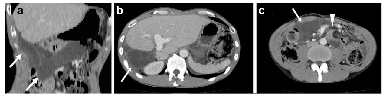
Fig. 1 Enhanced abdominal CT scan on an arrival a Coronal plane. b, c Transverse plane. a-c CT demonstrated dilated, fluid-filled small bowel loops with poor enhancement of the bowel wall. Arrows indicate a markedly dilated Roux limb. c. The triangle arrow indicates a "whirl" appearance