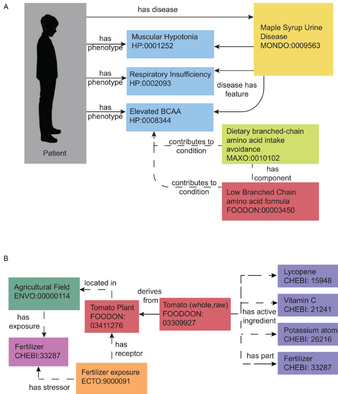
Figure 3. Representing nutrition using ontologies. Nutrition representation in current ontologies and databases is not yet sufficient to meet the needs of the nutri-informatics research community, yet some meaningful relationships can still be identified within the current landscape. Currently defined relationships can be seen with solid arrows and proposed modeling relationships can be seen in dashed arrows. (A) MSUD. This rare metabolic disease can be annotated with related phenotypes, nutritional recommendations and medical foods using interoperable biomedical ontology terms. These present and proposed relationships can be used to facilitate disease and therapeutic intervention identification with a set of patient phenotypes. (B) Farm to Fork with a Tomato. The process of growing a tomato can also be annotated by its exposures and nutrient content. Present and proposed relationships can connect fertilizer application at the field, to the food produced, to its nutrient and potential chemical content.

effort will be required to align and reuse existing resources to avoid duplication of work. A good example of such integration in ontologies is the Mondo Disease Ontology, which coordinates more than 17 different sources for an integrated representation of disease (86).