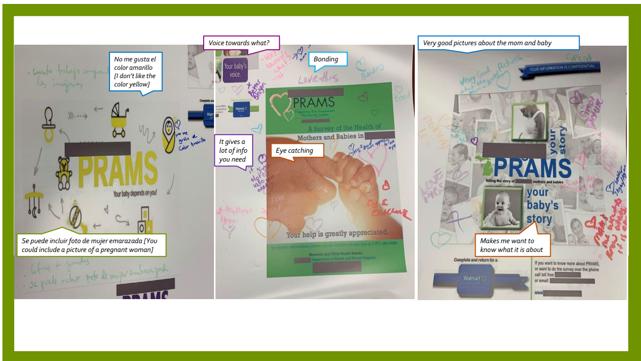
Fig. 2 Example PRAMS covers with participant feedback

they found it aesthetically pleasing and suitable for what the survey represents), design, and if questions in the survey were appropriate and necessary. The focus groups lasted approximately thirty to sixty minutes, were audio recorded, and transcribed verbatim (Spanish recording translated to