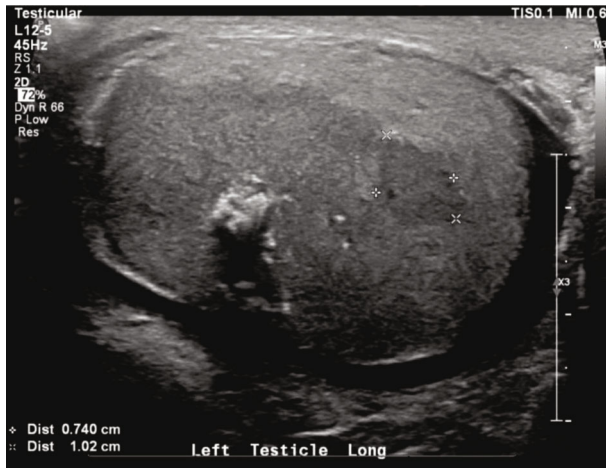
FIGURE 1: Scrotal ultrasound.