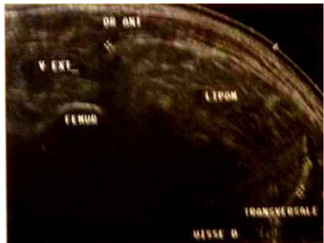
Figure 2 ultrasound aspect of a deep lipoma of the thigh.