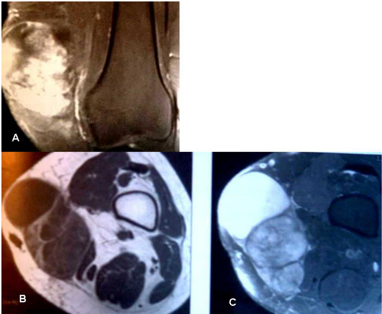
Figure 3 MRI: 3A, 3B: MRI-Scan of myxoid liposarcoma of the thigh, coronal (3A) and axial (3B) views.

logical diagnosis should be performed prior to any surgical treatment which allows early carcinolytic excision in case of malignancy. According to the standard surgical procedure, a wide excision should be performed each time the adjacent structures allow it (neurovascular axis). Should the surrounding structures be unfavorable, neoadjuvant chemotherapy and/or radiotherapy could be considered to reduce the tumor size [2,11,15]. A wide excision is performed without seeing the tumor, with a safety margin of at least 2 cm previously planned on the MRI Scan, combined with drainage in the axis of the surgical approach [2].