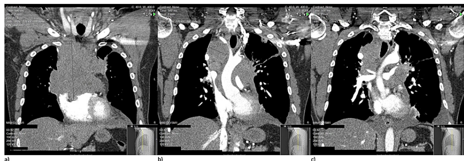
FIGURE 1: Three pre-treatment CT thorax coronal view cuts (anterior to posterior: a, b, c) depicting extensive mediastinal mass with impingement of coronary vessels, thoracic aorta, and superior vena cava.