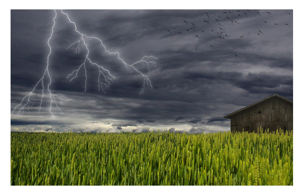
Figure 2 Picture of all elements required for a thunderstorm asthma epidemic: storm activity, presence of aeroallergen (in this case grass pollen), and human presence as shown by building.

near-surface air warming effects.<sup>31</sup> Secondly, changes to climate alter the growth patterns of allergen-producing plants and the production and dispersion of triggering pollens; with increasing atmospheric carbon dioxide levels predisposing plants to produce more pollen, this could substantially increase the risk of severe thunderstorm asthma events.<sup>29</sup> Thunderstorm asthma events are also more likely to occur in previously unaffected regions and outside of usual seasons due to these changes.