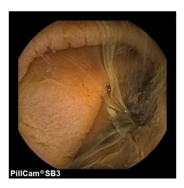
Figure 3. Mucosa atrophy of the small bowel.

In the tTGA positive group, 24 out 65 patients underwent VCE, and in 42% mucosal atrophy was detected, mainly in the proximal part of the small bowel (Figure 3). The percentage of patients with small bowel presenting with atrophy at VCE was 14% (5–40%). Notably, in only 3 (12.5%) cases, atrophy was histologically confirmed.