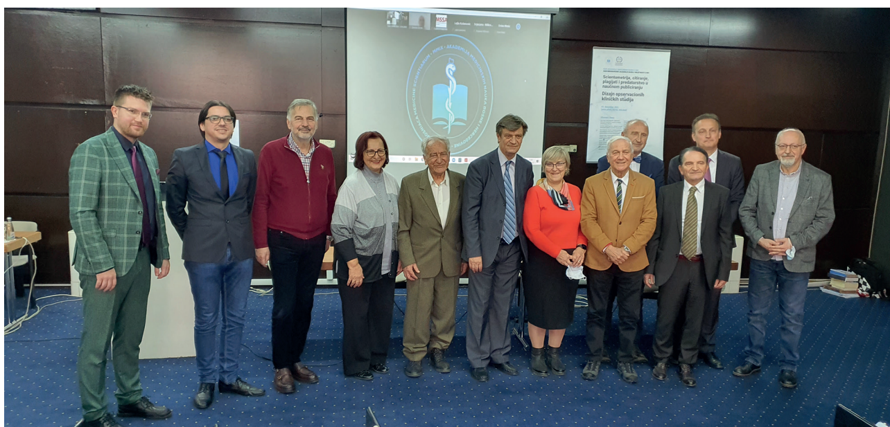
Figure 2. Participants of the Symposium: "Scientometrics, Citation, Plagiarism and Predatory in Science Editing", Sarajevo, BiH, 2021

scientists – authors who have published their articles in various indexed journals covered by the SCOPUS index database, located in Amsterdam, the Netherlands. On that list, among the 2% of the most cited authors, there are over 20 academics from existing academies in Bosnia and Herzegovina. Out of 10 lecturers at this Symposium, 5 are on this list.