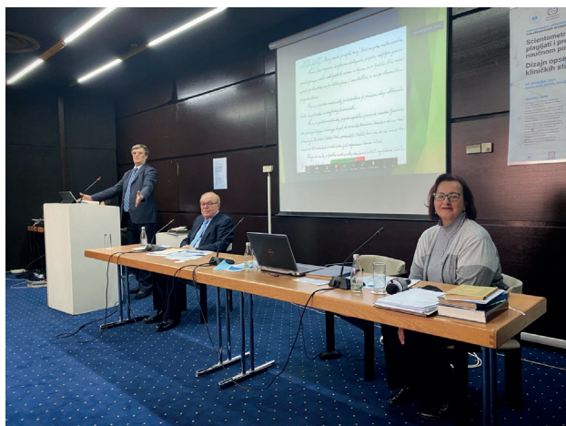
Figure 1. Opening speech of the "Days of AMNuBiH 2021 and SWEF 2021", Sarajevo, December 4th, 2021