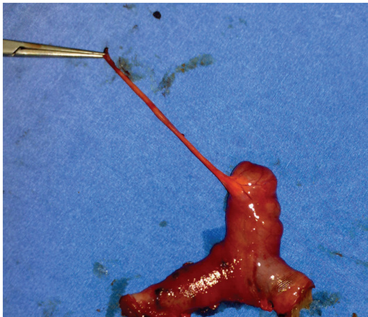
FIGURE 2: The view of resected Meckel's diverticulum and mesodiverticular band.