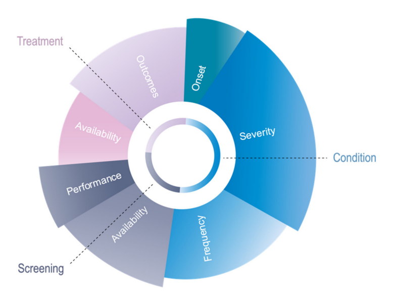
Figure 2. Components of novel algorithm.

Int. J. Neonatal Screen. 2022, 8, 25 8 of 22