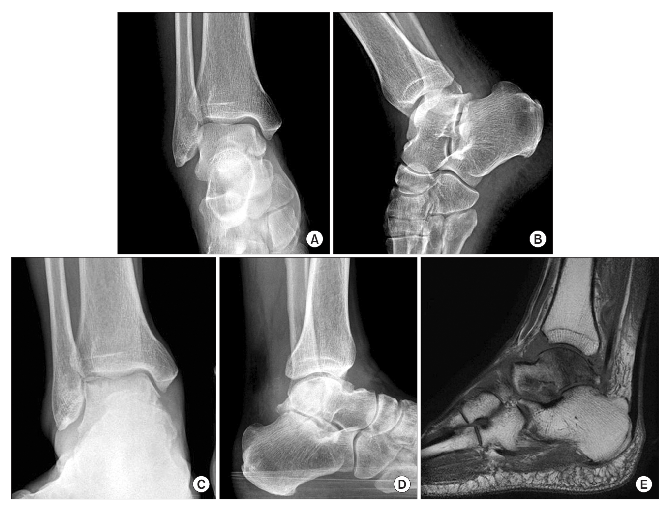
Fig. 1. (A) Frontal view of the ankle at initial presentation in the accident and emergency department. (B) Lateral view of the ankle at initial presentation in the accident and emergency department. (C, D) Frontal and lateral views of the ankle, showing a coronal shearing body fracture of the talus when the patient visited the clinic 5 months after the injury. (E) Sagittal magnetic resonance imaging demonstrating a coronal shearing body fracture of the talus accompanying avascular necrosis.

a "sprain" or they had booked an appointment with the author after a period of "persistent pain," following a visit to a primary care center. Prior to referral to the author's offices, only 1 patient had undergone MRI (Fig. 2). The rest of them had been diagnosed through a follow-up X-ray and advanced imaging modalities, including MRI (n = 3) and CT (n = 2) in the Eulji Medical Center (Figs. 3–6). Secondly, a 24-year-old female patient had visited the emergency room of the Eulji Medical Center with an injury to her left foot after falling from a step. On initial examination, the ankle joint was significantly swollen and severely tender. Massive hematomas were present in both the medial and lateral parts of the ankle spreading to the foot. At that time, no fractures had been identified on standard anteroposterior or lateral X-ray images. The pa-