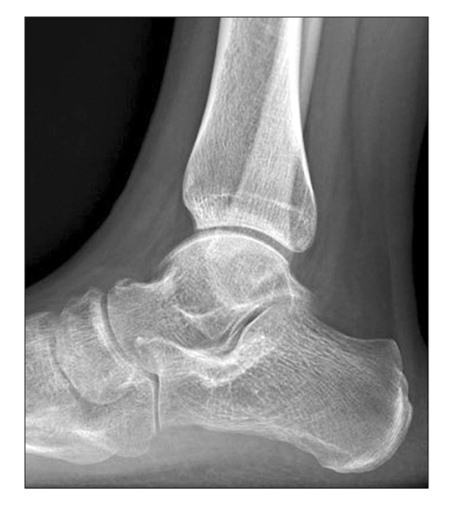
Fig. 5. Lateral view of the ankle, which shows a talar neck fracture with a malunion, when the patient visited the clinic 8 months after the injury.

fifth metatarsal base, distal and proximal fibula, and the anterior process of the calcaneus. In addition to the lateral ankle ligaments, the soft tissue structures at risk include the distal tibia-fibula ligament, posterior talofibular ligament, subtalar interosseous ligaments, peroneal tendons, peroneal retinaculum, superficial peroneal nerve branches, and the medial ankle structures.