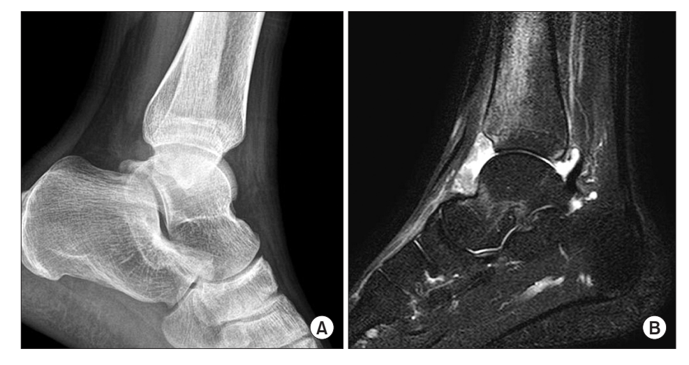
Fig. 6. (A) Lateral view of the ankle, showing a minimally displaced talar neck fracture, 4 months after the injury. (B) Sagittal magnetic resonance imaging demonstrating a minimally displaced talar neck fracture.

Fractures of the lateral process of the talus are frequently overlooked and should be considered in the differential diagnosis of patients with acute and chronic ankle pain.<sup>6)</sup> The lateral process fracture is rare, missed initially in about 50% of cases, and usually needs to be fixed internally. The diagnosis of a fracture of the posterior process is usually difficult, especially if the displacement is not significant. It is important to recognize these fractures because they result in severe limitations in ankle and subtalar motions.<sup>3,7)</sup> Our study is the first report of talar body or neck fractures after such minor injuries, suggesting the fractures of the talar neck or body should be considered as