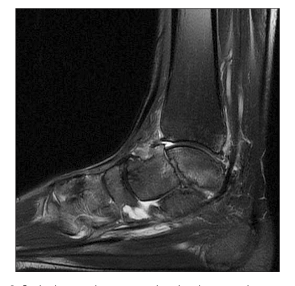
Fig. 2. Sagittal magnetic resonance imaging demonstrating a coronal shearing body fracture of the talus with a secondary arthritic change of the tibiotalar and subtalar joints.