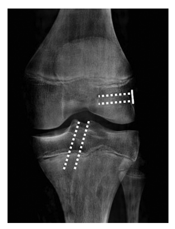
Fig 3. Relationship between the physis and the tunnels: a postoperative radiograph of method B (left knee).

epiphysiodesis of the limb obtained very satisfactory results, providing an additional argument in favor of careful monitoring of the growth of young patients.