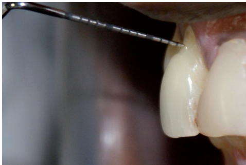
Fig. 1. A positive.

A total of 1400 exposed root surfaces were examined to detect the presence of CEJ and the associated root surface defect. The maxillary and mandibular arch showed 793 and 607 teeth with areas of recession respectively (Figs. 1-4). Out of these teeth, 36% were premolars; 32% molars; 21% incisors and 11% canines (Table 2). A total of 68% of these areas were in the aesthetic zone.