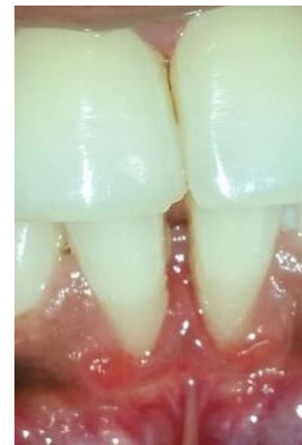
Fig. 4. B negative.

treatment of these defects in premolars demands further studies. In addition 130 patients out of 150 were using horizontal scrub technique (86.6%) and 12 patients were using tooth powder and tooth brush (8.6%).