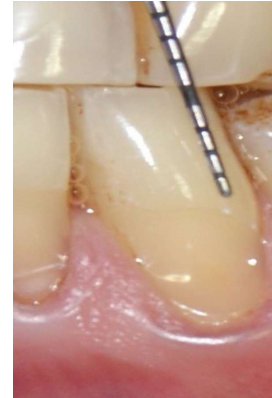
Fig. 3. B positive.

The class A – defects were observed in 499 teeth (284 maxillary and 215 mandibular teeth) which constituted 36% of total. Following this Class A+ defects were seen in 405 teeth i.e. 29% (231 maxillary and 174 mandibular). Subsequently class B+ defects were seen in 322 teeth i.e. 23% (193 maxillary and 129 mandibular) and finally the class B- defects were seen in 174 teeth i.e. 10% (maxillary 85 and mandibular 89) (Table 3). Since, the smile line normally extends till premolars and hence, the