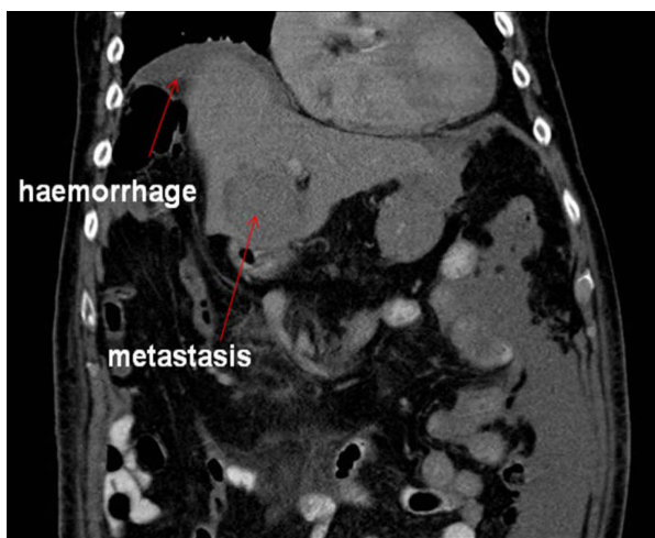
Figure 1 Coronal computed tomography view of the patient showing intra-abdominal hemorrhage and liver metastasis (red arrows).

Our patient had an esophageal gastro-duodenal endoscopy as he had been taking aspirin and had a past history of a duodenal ulcer. This did not show any evidence of bleeding. A rigid sigmoidoscopy was also normal.