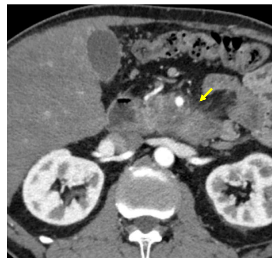
Figure 4. Pancreatic lesion with ill-defined margins (arrow) on CT examination in pancreatic contrast phase.