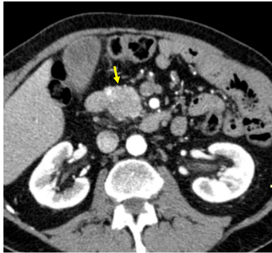
Figure 2. Pancreatic lesion with well-defined margins (arrow) on CT examination in pancreatic contrast phase.