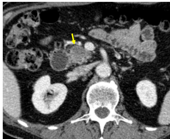
Figure 3. Pancreatic lesion with well-defined margins (arrow) on CT examination in portal-venous contrast phase.