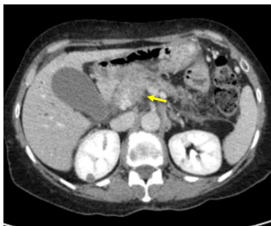
Figure 5. Pancreatic lesion with ill-defined margins (arrow) on CT examination in portal-venous contrast phase.