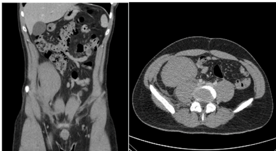
Fig. 1. Admission CT scan.

This research did not receive any specific grant from funding agencies in the public, commercial, or not-for-profit sectors.