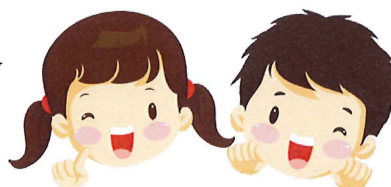
Figure 2 Capsule swallowing training guidelines—modified from the 'Teach children how to swallow tablets and capsules' guidelines by the Royal Children's Hospital ( http://www.rch.org.au/pharmacy/clinical_services/Teach_children_how_to_swallow_tablets_and_capsules ).

This guideline is a modification version of the "Teach children how to swallow tablets and capsules: A guide for parents, caregivers and children over 4 years" by Royal Children's Hospital.