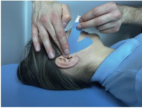
FIGURE 1: The muscular application of KT to the area of the masseter.