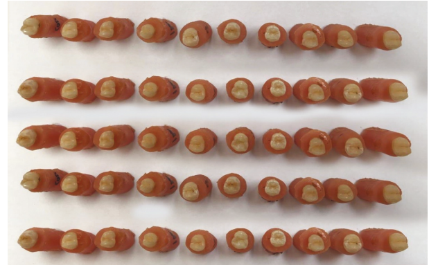
FIGURE 1: The prepared specimens of the study groups.

2.3. Shear Bond Strength Testing. Following preparations, all specimens were air-dried and subjected to a two-step etch-and-rinse adhesive system (Adper Single Bond 2; 3M ESPE, St. Paul, MN, USA) according to the manufacturer's instructions. A nanohybrid composite (Z350; 3M ESPE, St. Paul, MN, USA) was placed in 2 mm thick Teflon molds with 3 mm diameter and light-cured for 40 seconds using an LED curing light (Demi™ Plus, Kerr Dental, Bioggio, Switzerland) with light intensity at 1200 mW/cm 2 and a wavelength of 470 nm throughout the study.