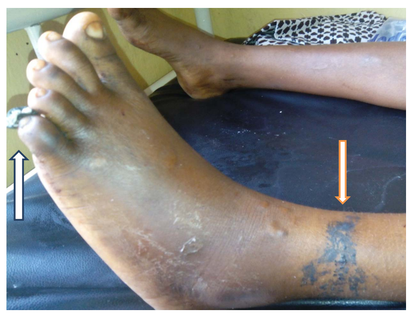
Fig. 1. Left leg showing edema, incision site with herbal medicine and black stone applied on the little toe.

Adebayo A. Adewole Dept. of O&G, FMC Lokoja, Nigeria