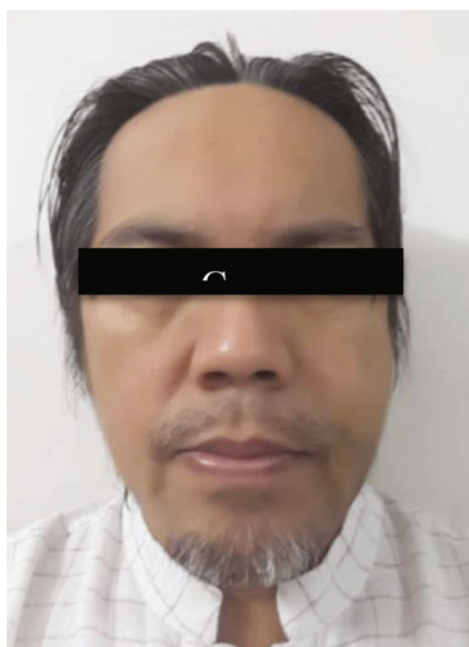
FIGURE 5: Postoperative day 3 shows that residual left malar swelling remains.

SE usually is self-limiting and does not require treatment, but observation is crucial [8]. Occasionally, subcutaneous emphysema can cause infection [7, 12]. Antibiotics are therefore commonly prescribed in SE. The rationale for antibiotic prescription is that air introduced subcutaneously could be nonsterile [7]. A broad-spectrum-coverage antibiotic can be used to cover the more common head, neck, sinus, and skin microflora. Systemic steroids, meanwhile, can be used to reduce soft-tissue edema [13]. Rarely, an extensive SE may need multiple stab incisions to decompress the emphysema [8]. Subcutaneous emphysema could also be fatal in the case where the emphysema travels to the lateral pharyngeal space and may reach the mediastinum by dissecting the visceral