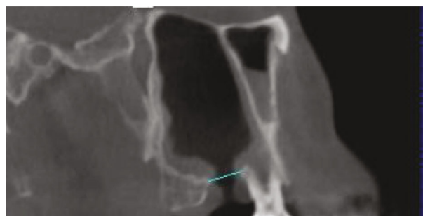
FIGURE 2: Cone beam computed tomography (CBTC) showing the oroantral communication in sagittal view.