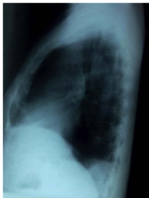
Fig. 2. Chest X-ray, left lateral view showing almost complete resolution of the opacity.

With the emergence of CT chest as a diagnostic modality, chest X-ray especially the lateral view is taken less frequently nowadays. A lateral chest X-ray taken additional to the postero-anterior view may not improve the sensitivity or specificity of detection of conditions like pneumonia [1]. Lateral view of the thorax on the chest X-ray also does not give any additional benefit in detecting small pulmonary nodules [2]. CT chest is also proven to be superior to chest X-ray in patients with