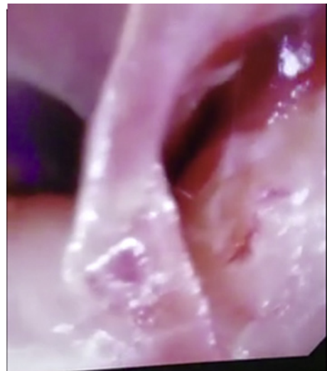
Fig. 3. Mucosal flap at the proximal esophagus with a false tract into the submucosal space (Right) and normal esophageal lumen (Left).