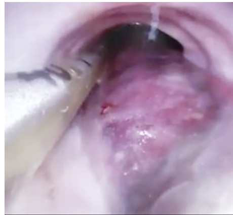
Fig. 2. Suspected submucosal abnormality with bulging and bluish discoloration in the mid esophagus.