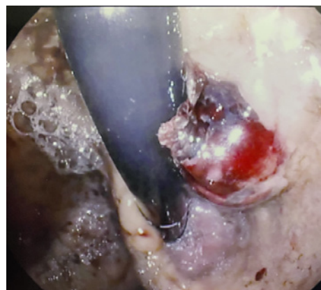
Fig. 1. Gastric cardia defect with appearance of possible puncture site.