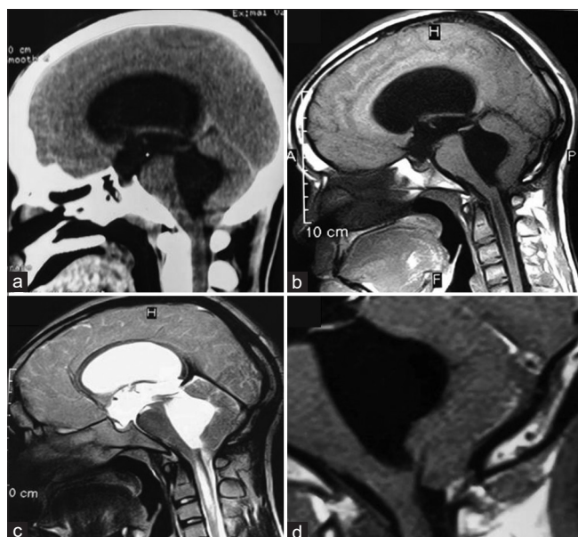
Figure 1: Sagittal (a) Computed tomography scan demonstrating dilation of all ventricles. Sagittal (b and d) T1-weighted, sagittal (c) T2-weighted magnetic resonance imaging showing dilation of all ventricles, Chiari malformation type I, obliteration of the retrocerebellar cerebrospinal fluid space, and syringomyelia

reduced in volume by the very large dilatation of the fourth ventricle [Figure 1].