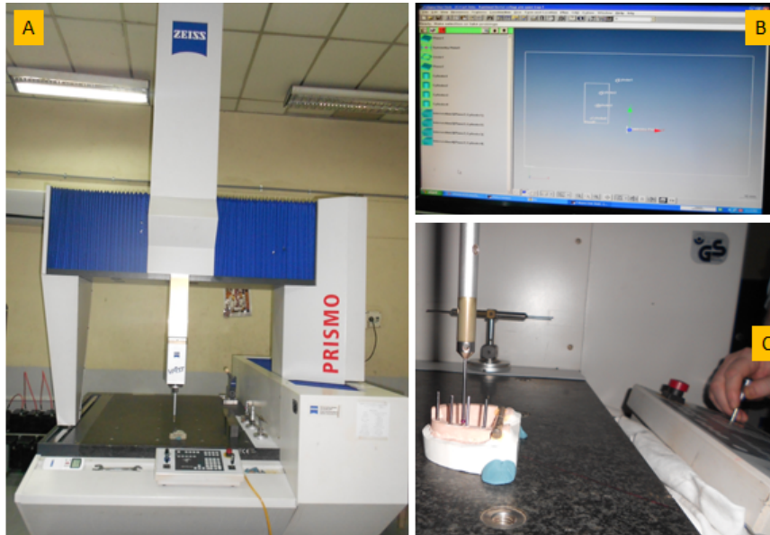
Fig. 3: A) Coordinated Measuring Microscope (CMM) with 1mm wide straight probe, B) Data processor, 3C) Long guide screws were tightened into the implants to reveal central axes of the implants.

given by the data processor. In X, Y and Z co-ordinates linear distance can be calculated by using this formula (6), (Fig. 4).