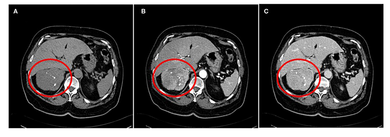
FIGURE 1 | A contrast-enhanced abdominal CT scan showing a quite large heterogenous mass with focal calcifications (A) ~9 cm in size. The lesion had not only arterial (B) but also venous enhancement, while some areas remained nonenhanced, possibly necrotic (C).