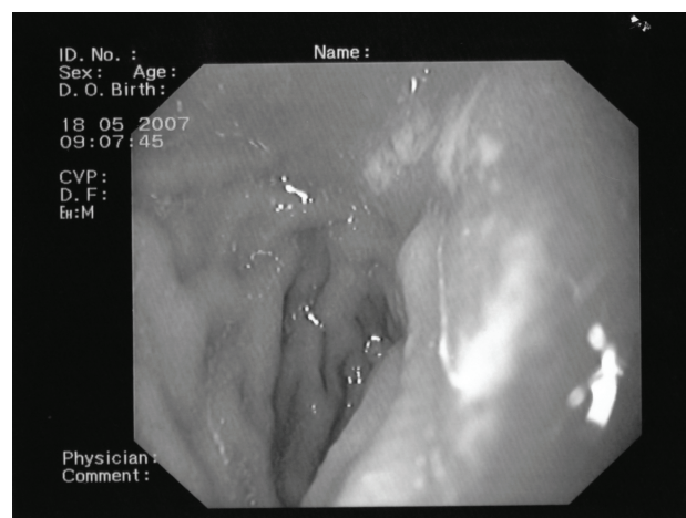
Fig. 3 Endoscopy: severe esophagitis, circumferential ulcerations with granulation tissue of the oesophageal wall

-grade IV (stricture) manifests similar to grade III at which stenosis of the oesophageal lumen is added with old lesions of the columnar epithelium and short oesophagus. [7]