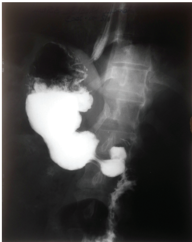
Fig. 4 Radiological control after Nissen fundoplication (48 h postoperatively)

For the 29 patients with hiatal hernia, Nissen Rosetti was performed in 17 and Toupet fundoplication in 12.